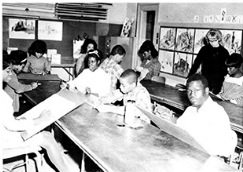
"Art is Effective Visual Communication"