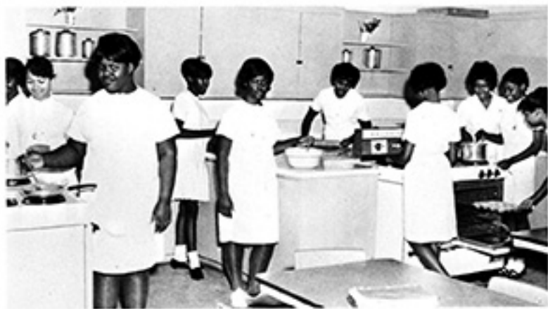
Cooking Lab: to develop skills in food planning, preparation and service.