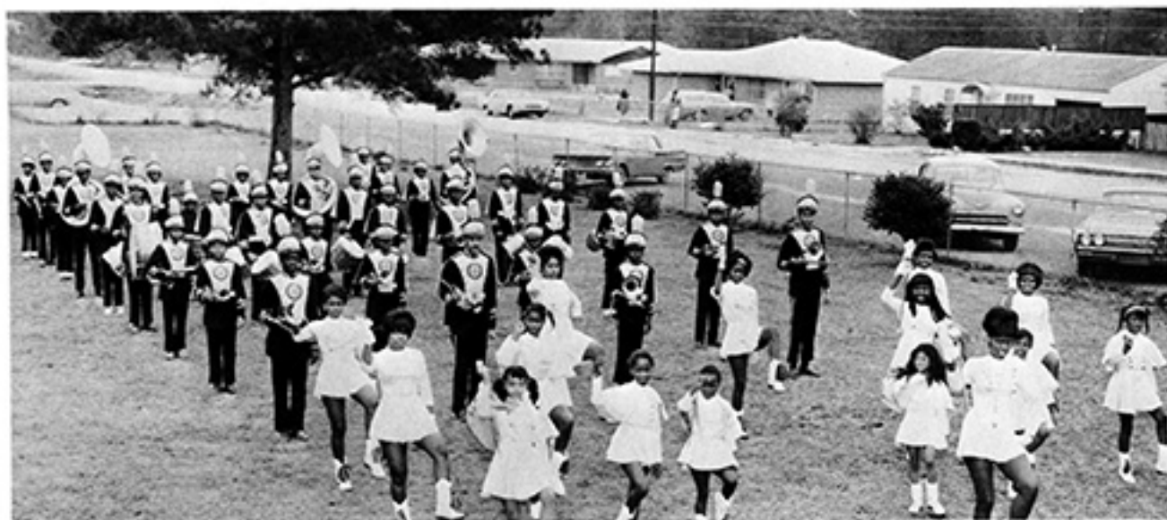
VERNON HIGH CONCERT BAND