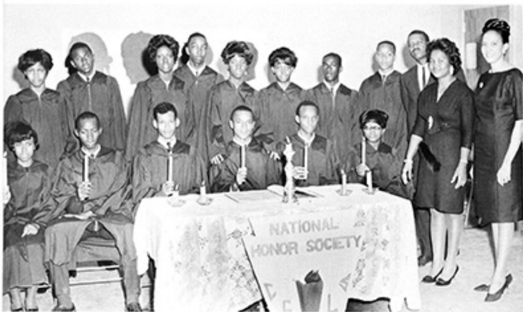
Induction Ceremony 1967 '68