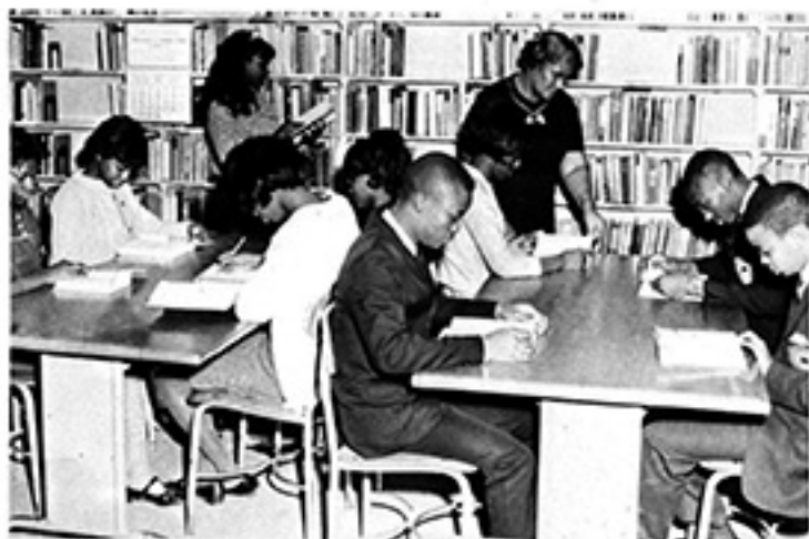
The Vernon High Library has more than four thousand volumes. The library serves both Vernon High and Vernon Elementary Schools.