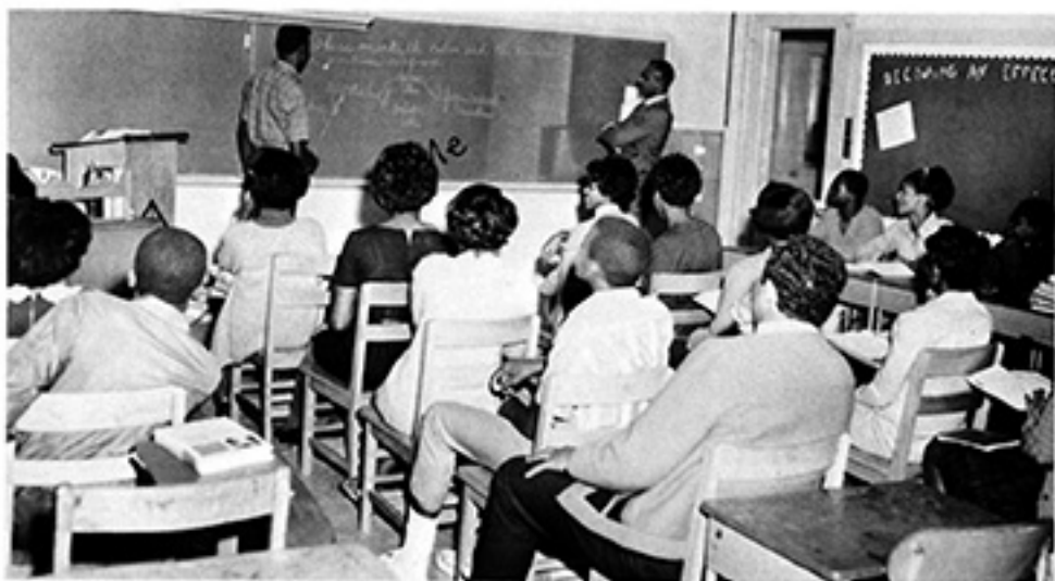
This English class is studying parts of speech and sentence structure with the aid of diagraming.