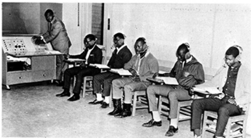
The Foreign Language Department at Vernon High School is equipped with the latest apparatus used in teaching modern foreign languages. Here you see students in French I taking advantage of this equipment. They are learning to converse in the French language.