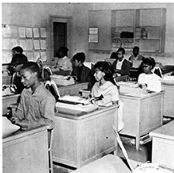
The Vernon High Business Department includes classes in typing, general business and bookkeeping.

Your high school driver education course is dedicated to the goal of helping young people save their lives, by giving driving skills that will last you a lifetime.