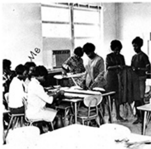
Clothing Class: to develop skills in clothing techniques and construction.

Industrial Arts is an essential part of general education. It provides experience in the use of materials, tools, and equipment and a knowledge of the processes and products of industry and their social and economic significance to the life of the community and the nation.