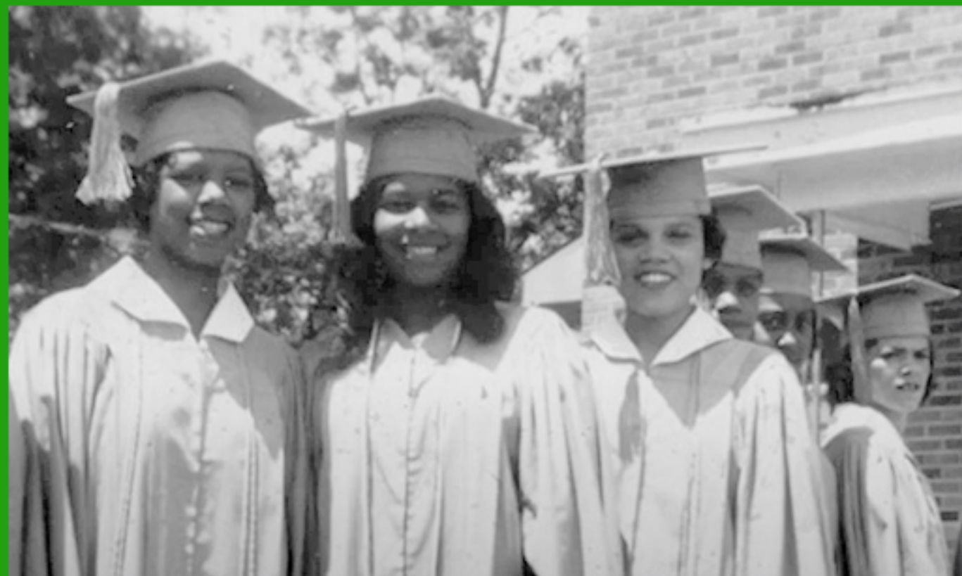
Cohn High School Graduation