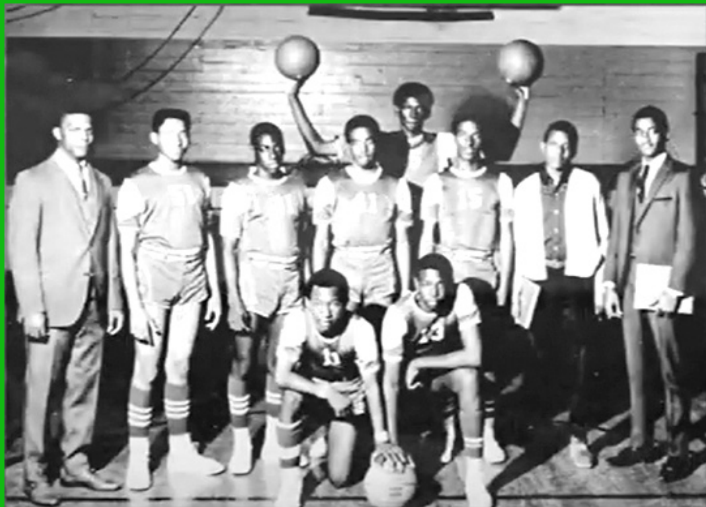
Cohn High School Basketball Team