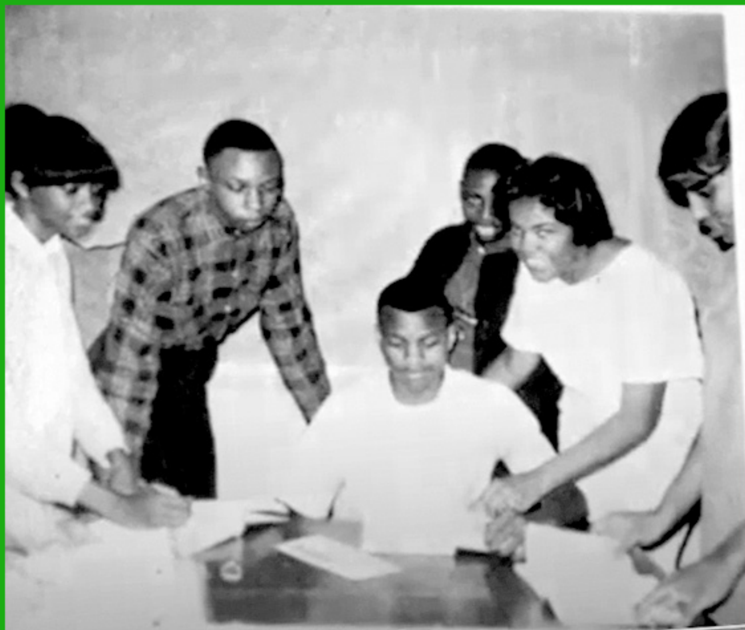
Cohn High School Students