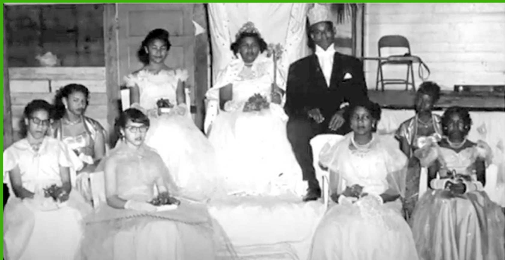
Cohn High School Celebration