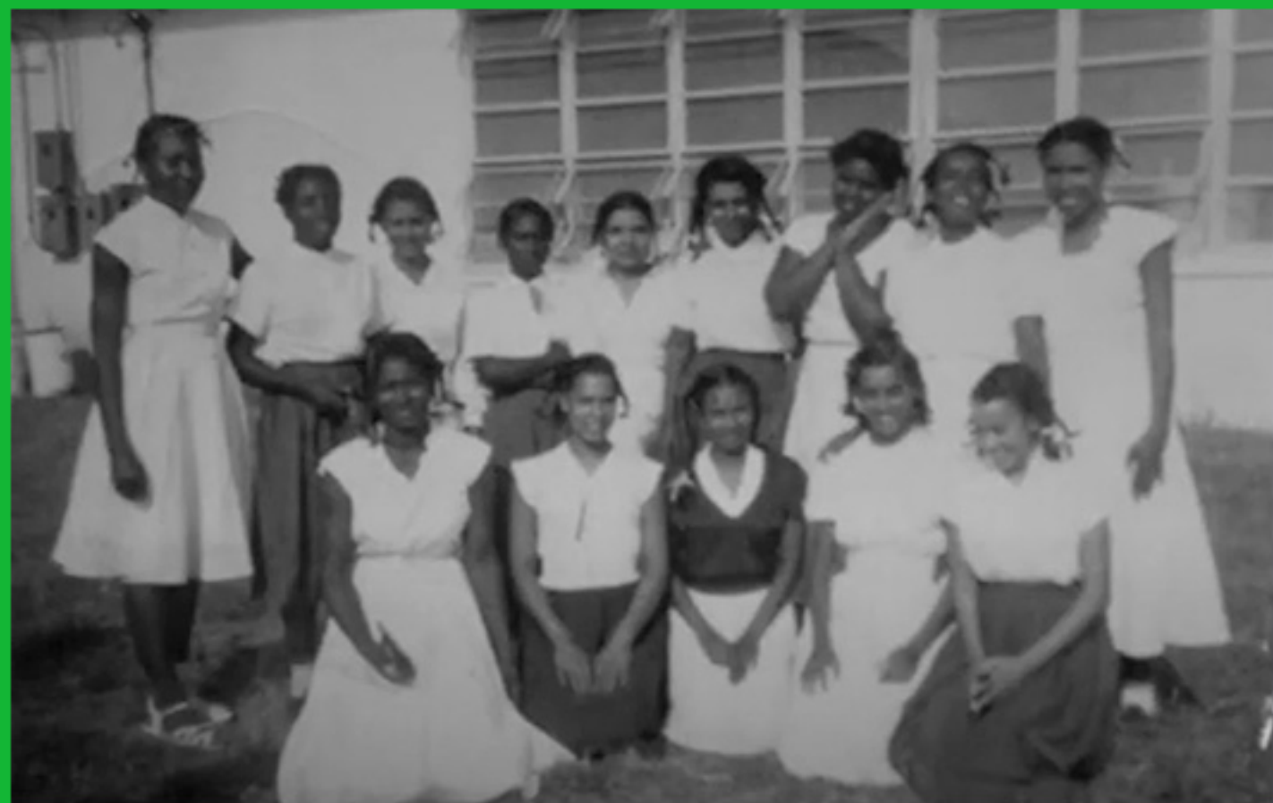
Cohn High School Students