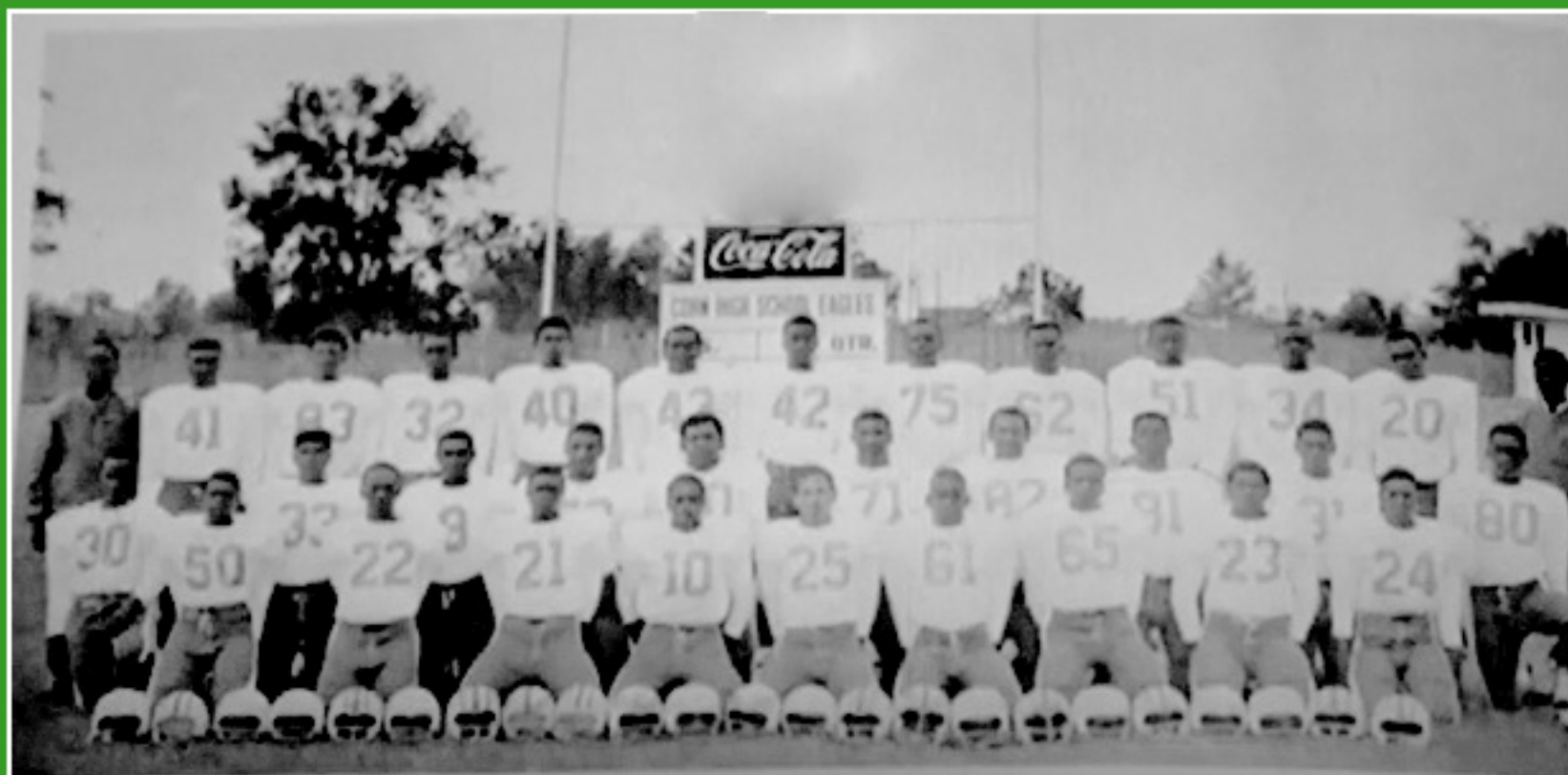
Cohn High School Football Team