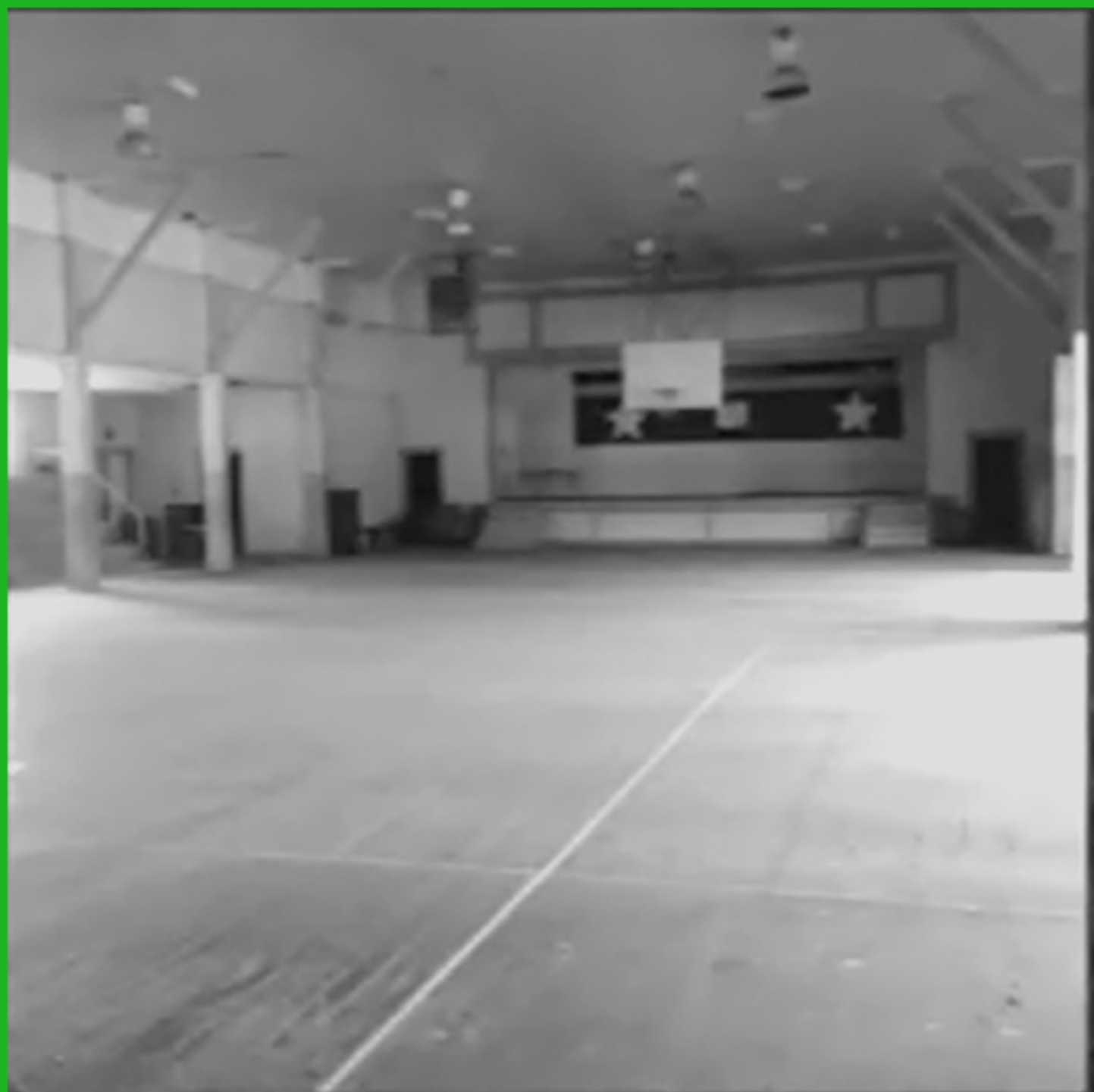
Cohn High School Gymnasium