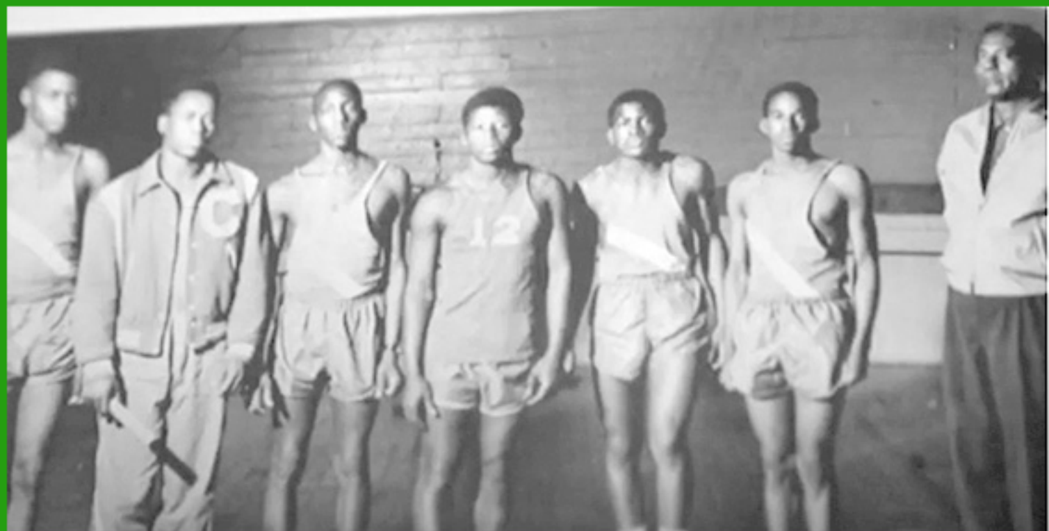
Cohn High School Track Team