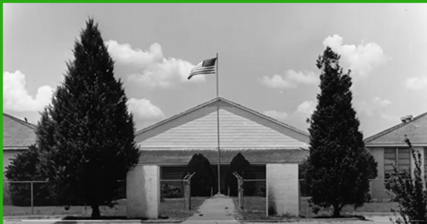
Cohn High School Picture2