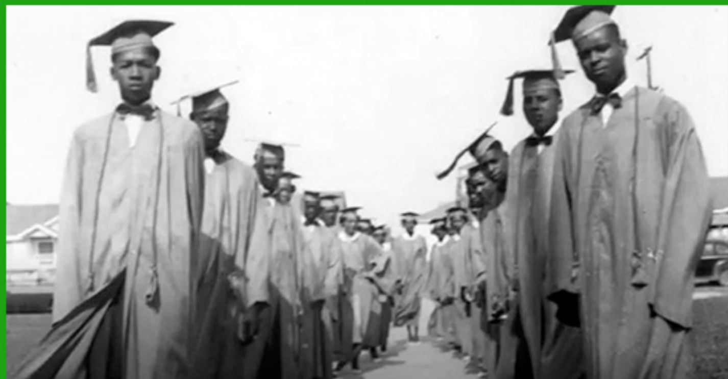
Cohn High School Graduation Day