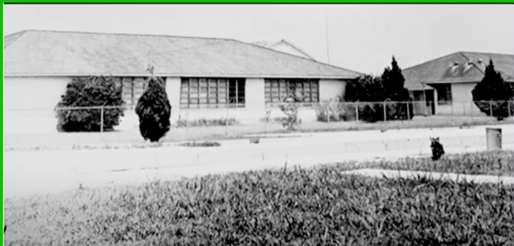
Cohn High School