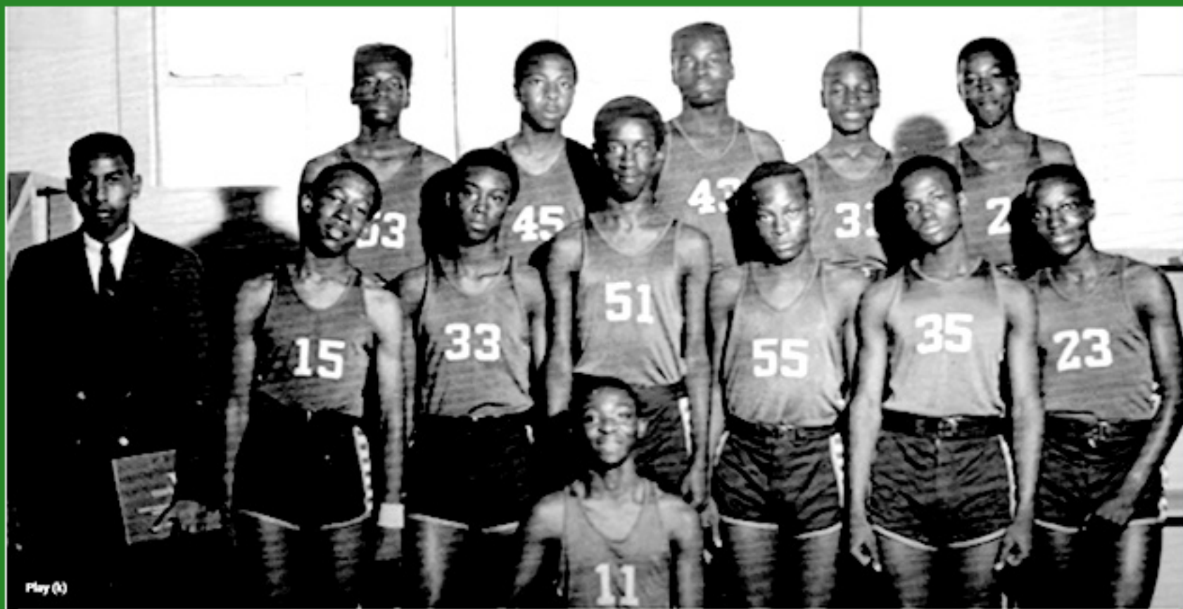
Cohn High School Basketball Team