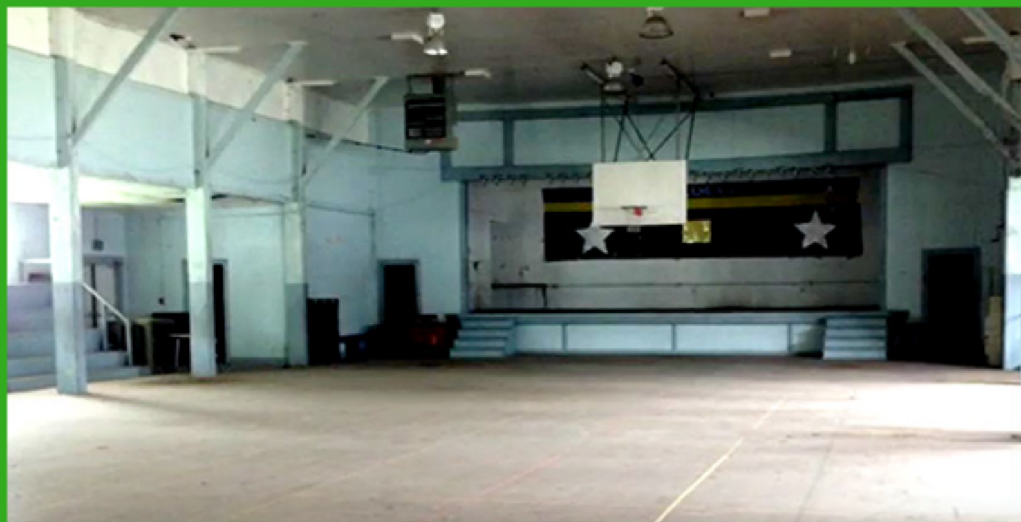
Cohn High School Gymnasium