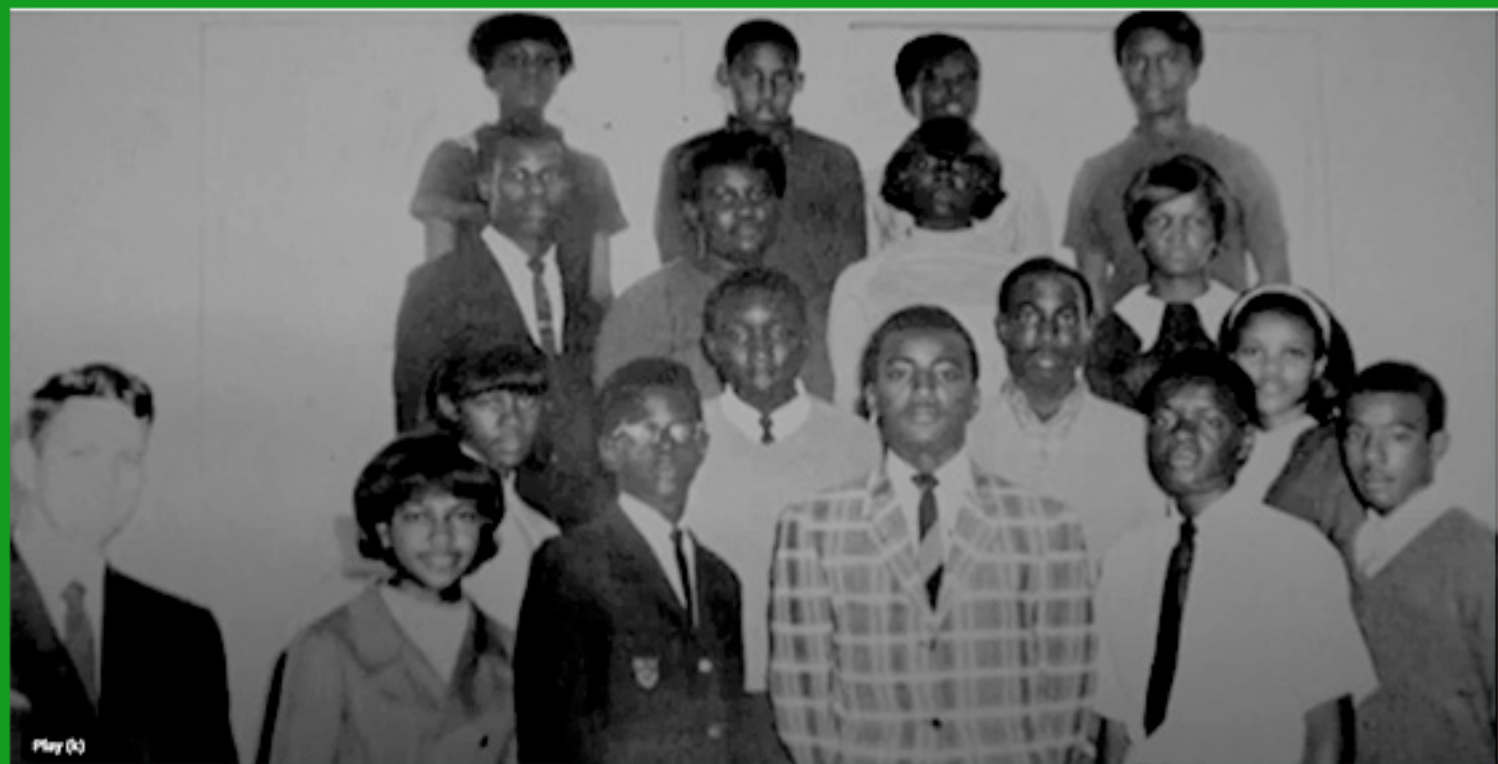
Cohn High School Students