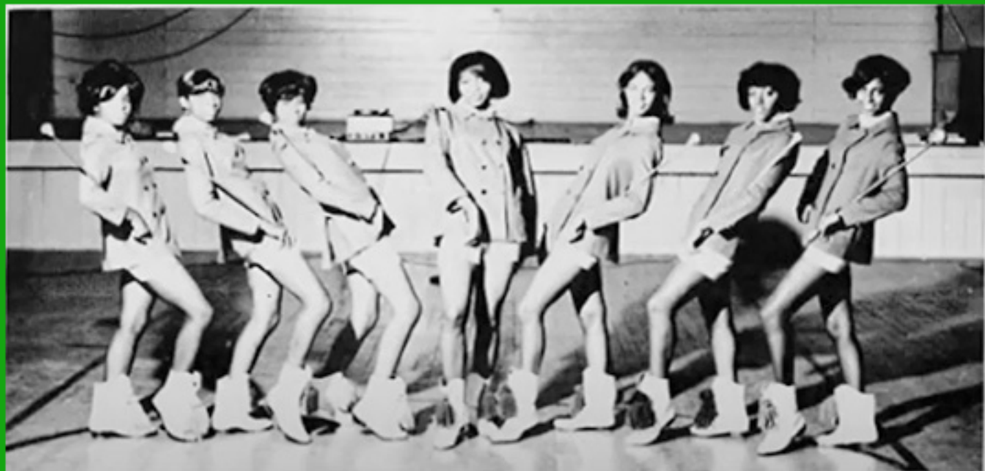
Cohn High School Majorettes