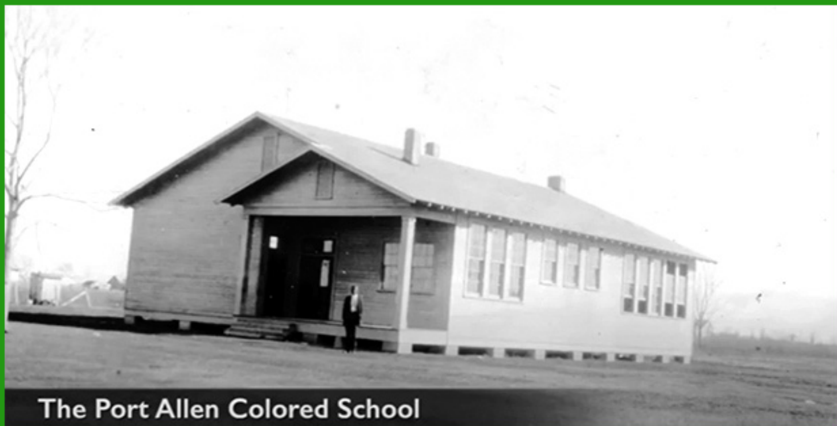
The Port Allen Colored School