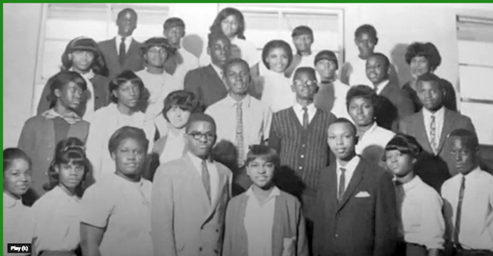
Cohn High Student Council