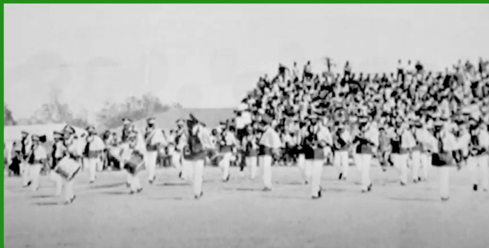
Cohn High School Band