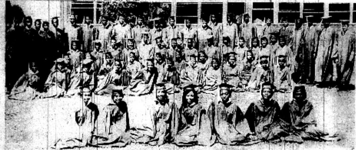
COMMENCEMENT EXERCISES for Paul Dunbar High School will be held Monday, May 25, at 8 p.m. in the school gymnasium in Washington. The school will