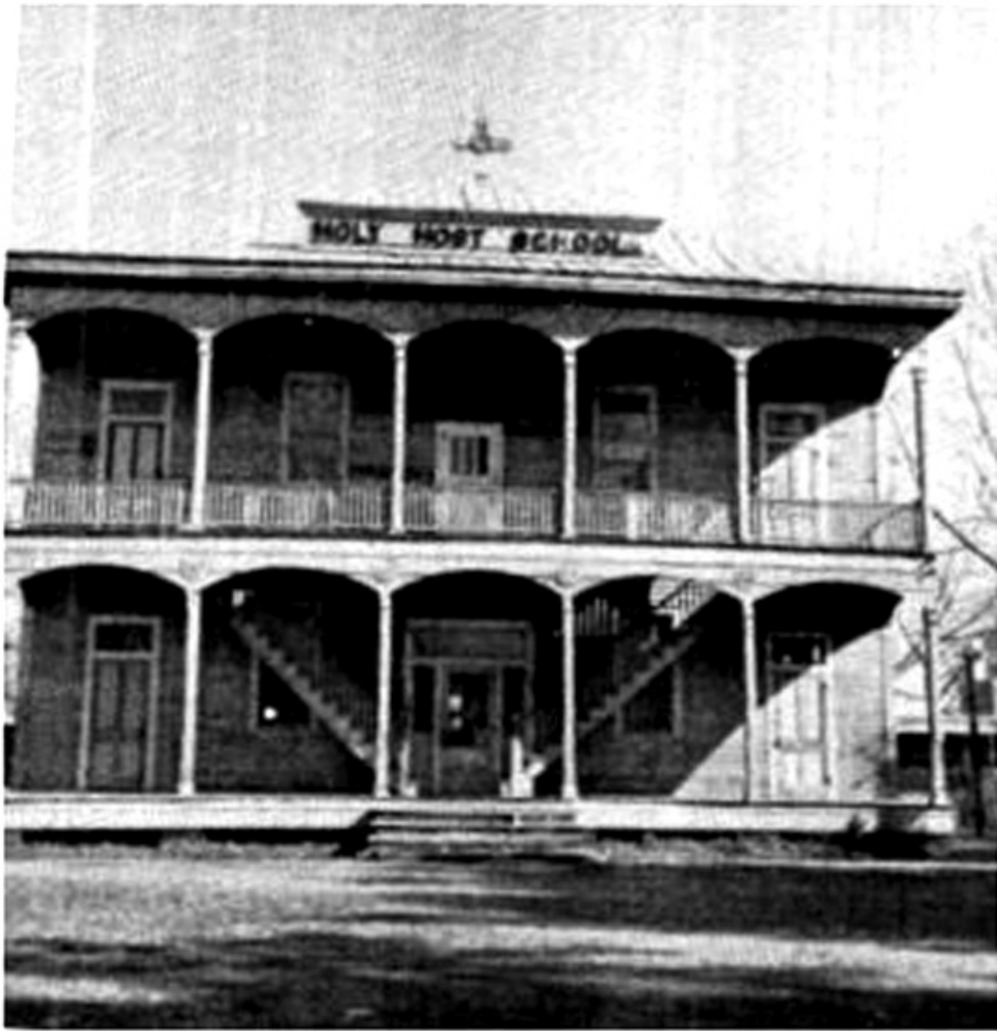
St Joseph's School 1914