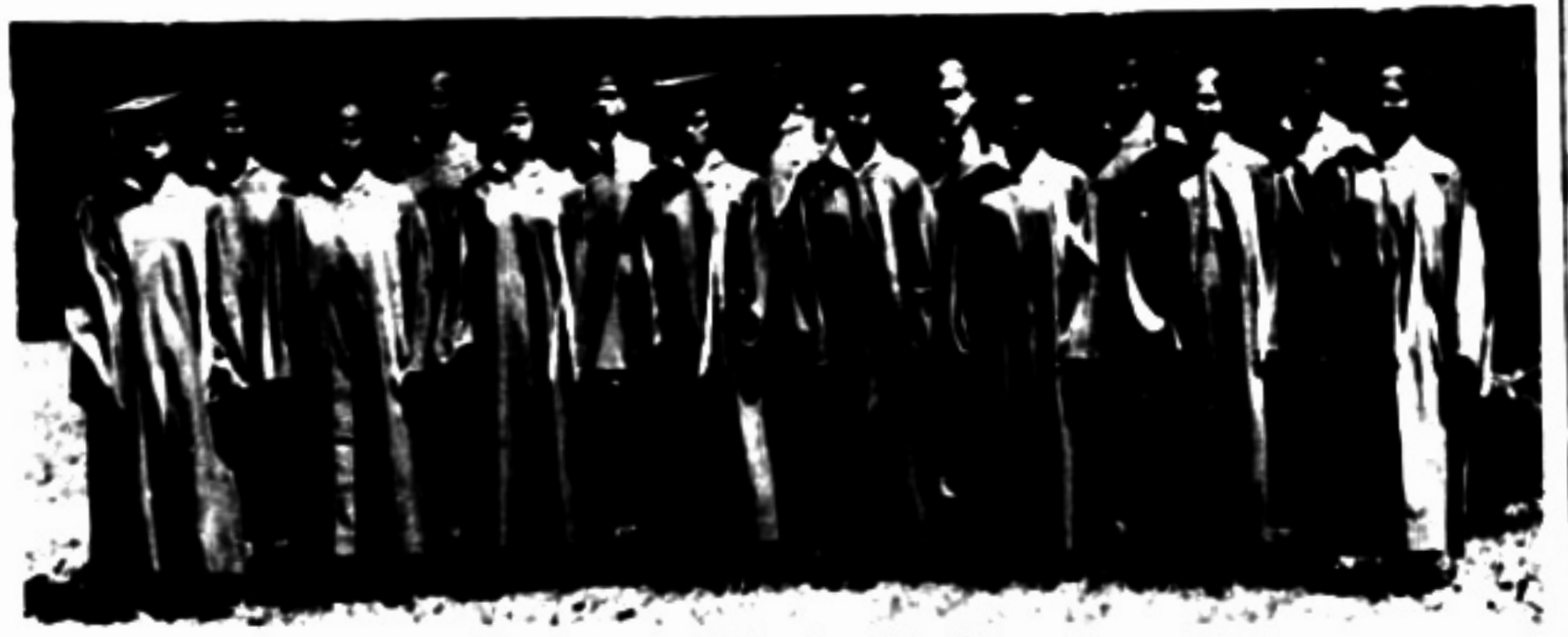
Seniors of Holy Chost School