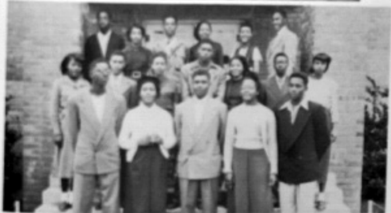
P R I N C I P A L S A D V. C O M M.