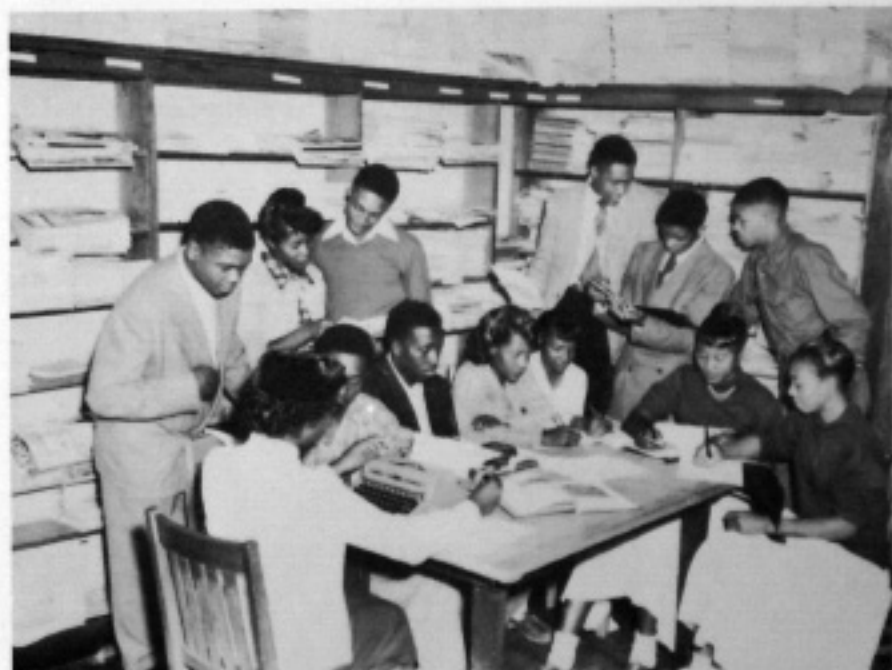
1950 Wolf Staff at work.