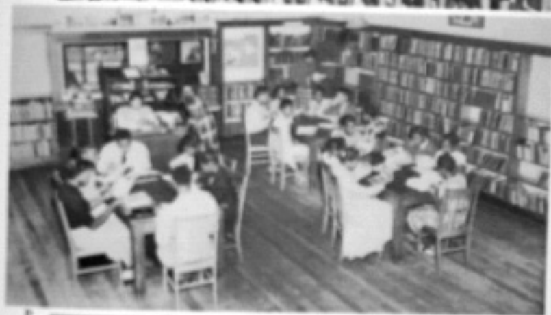
B O O K C L U B