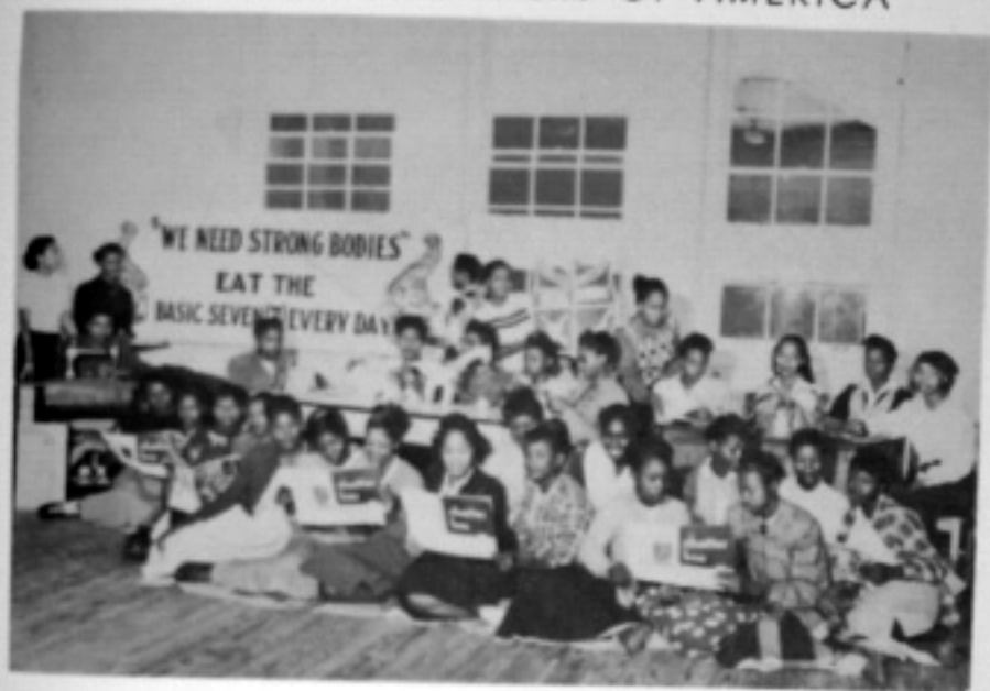
NEW HOMEMAKERS of AMERICA PLEDGE CLUB