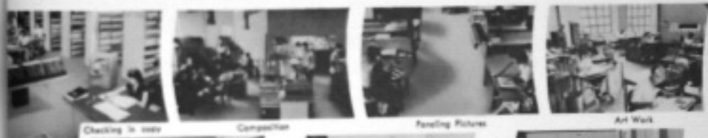
Checking in copy

SKILLED CRAFTSMEN — MODERN EQUIPMENT and 35,000 SQUARE FEET OF FLOOR AREA are combined to produce FINE SCHOOL ANNUALS for 1400 schools in twenty-three states