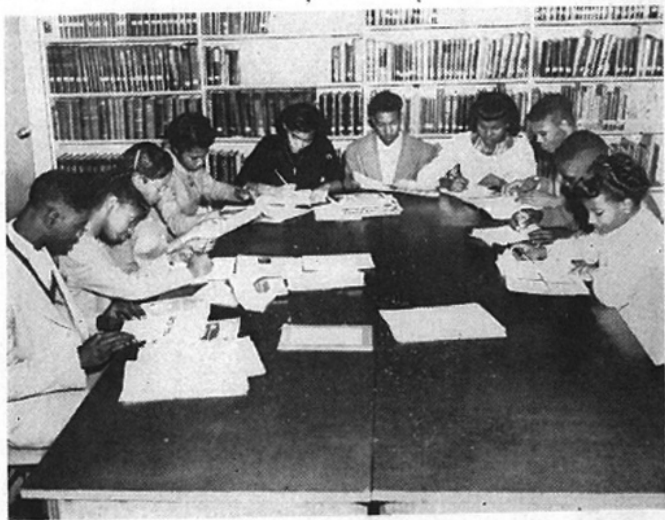
The editorial staff giving a final check to the school paper. Our patrons are informed about the school program through school publications.