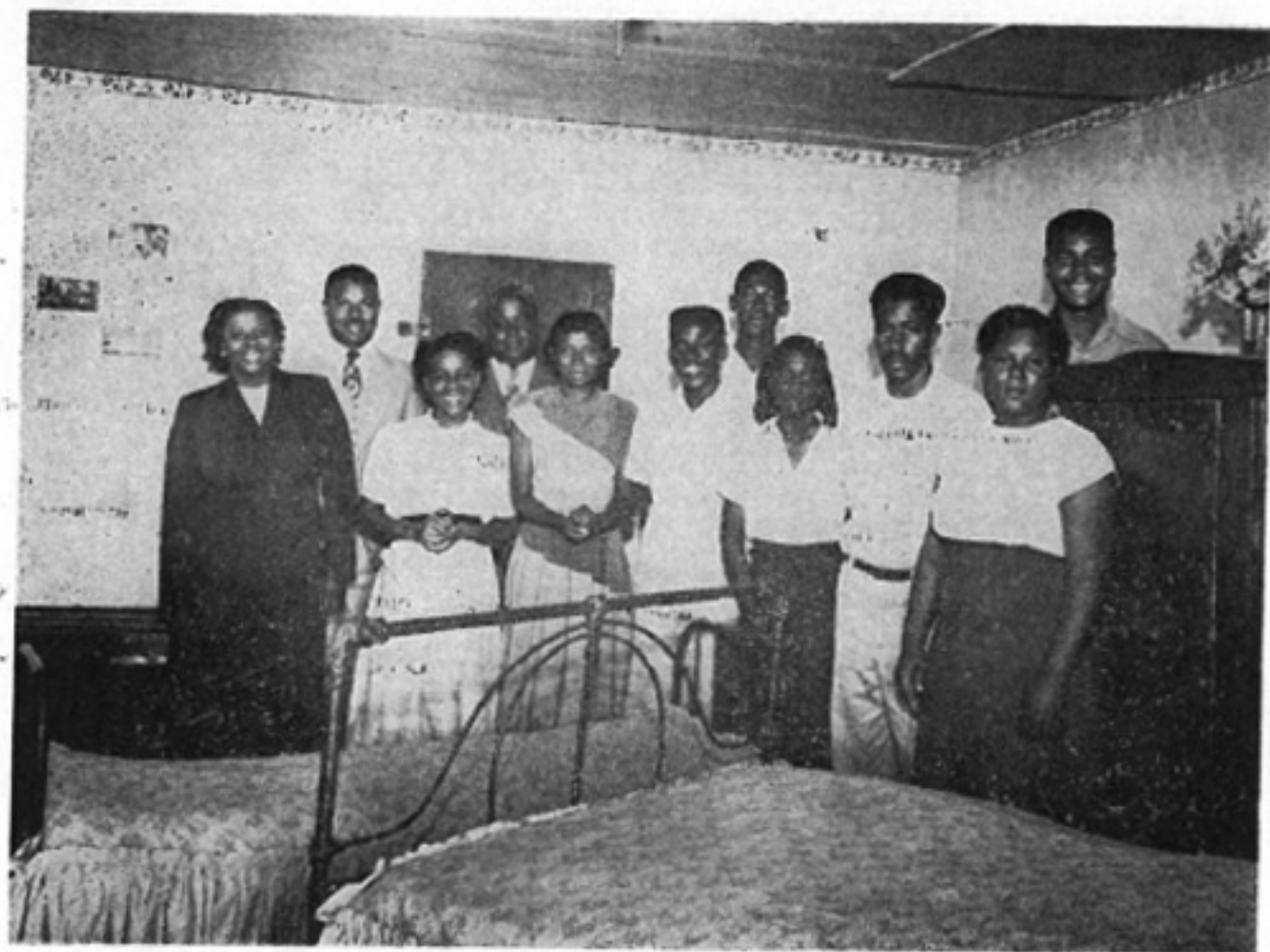
New Farmers and New Homemakers of America

The total scope of this project included activities of the teachers, pupils, parents and owner of the plantation. In nature, this project offers a challenge to education and our community to become more concerned about the home conditions of a large group of our school children. We owe the patrons of these children some guidance.