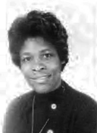
Georgia Forecia Social Studies