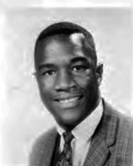
You're really going to the Prom with me?