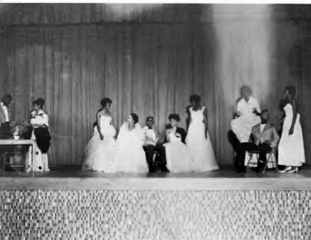
Thespian Troupe 1009 Scene from "Lady Windermere's Fan"