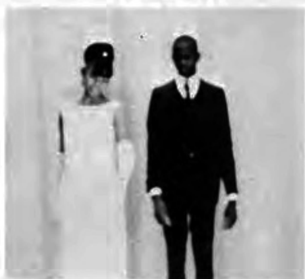
My first date ! ! !