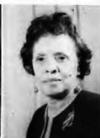
William Sands Sheet Metal