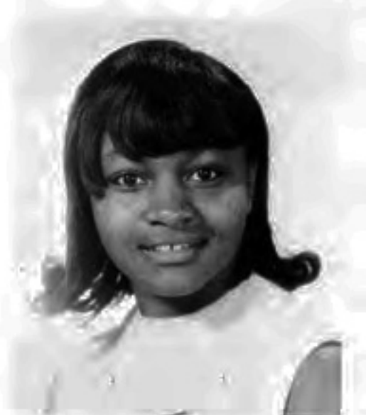
You mean I really won the beauty contest?