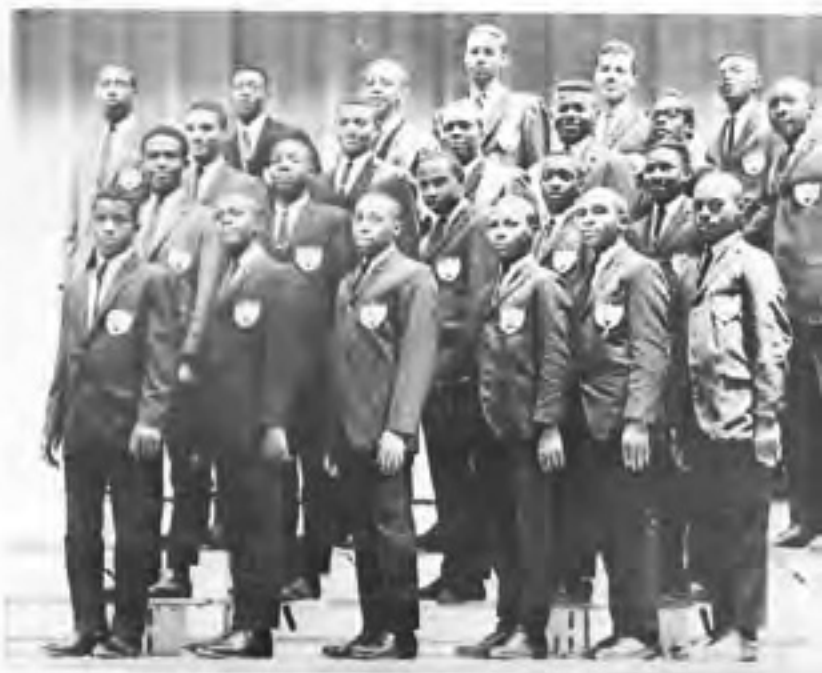
Boys' Glee Club