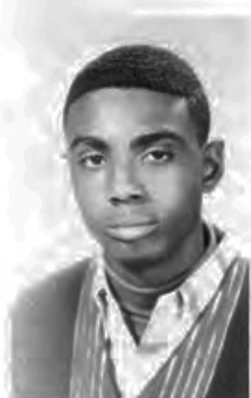
Will May ever get here?