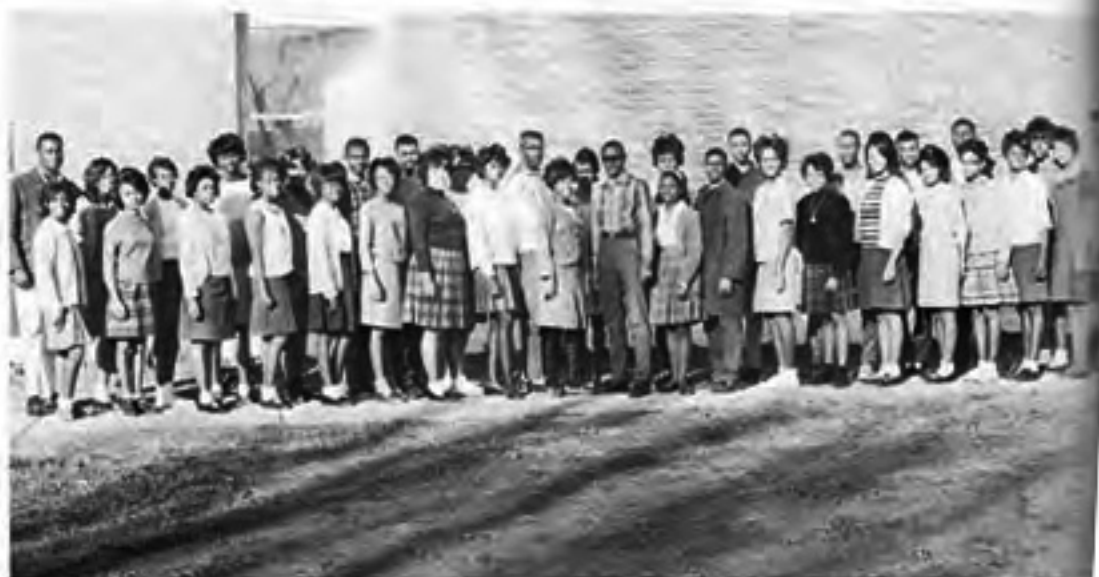
1966-67 Student Council Members