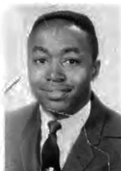
It tears me up!