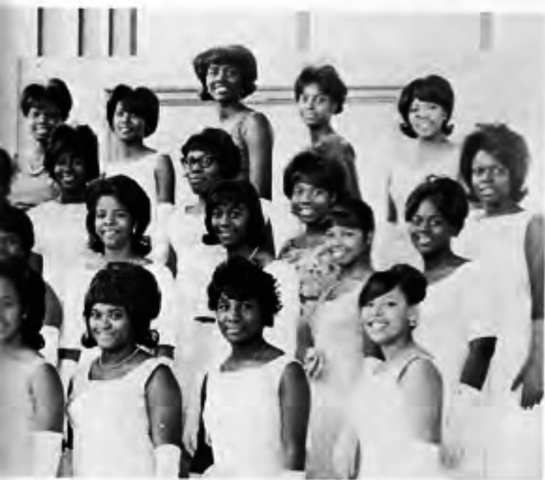
Girls' Glee Club