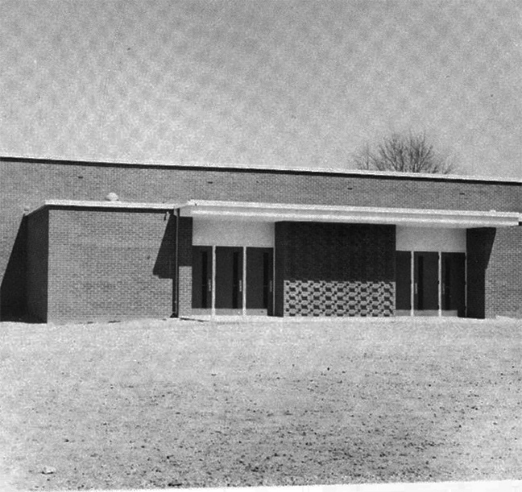
Auditorium — 1965