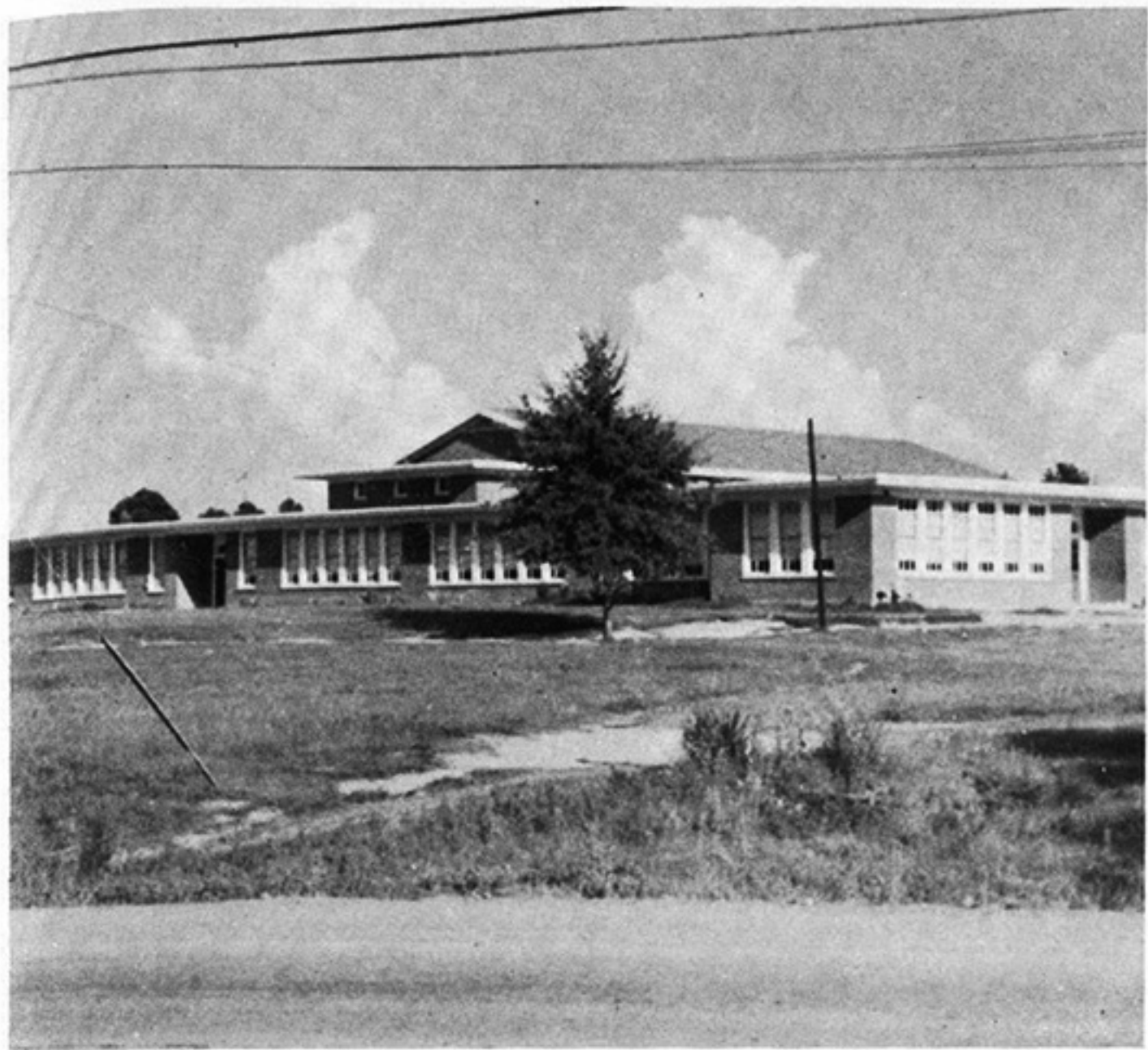
High School Building — 1949