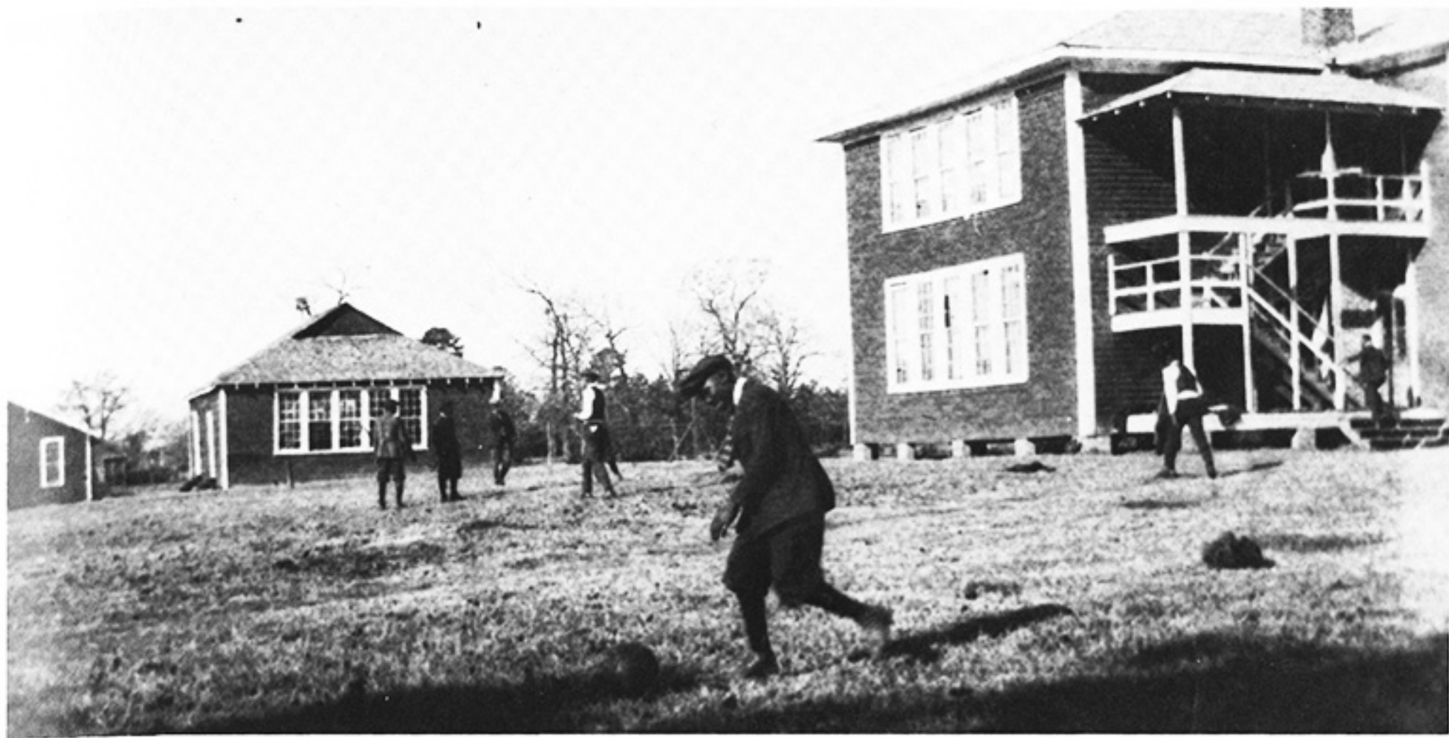
First School Building — 1916