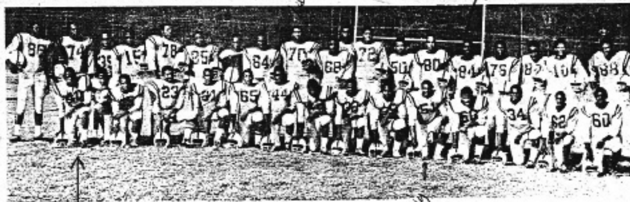
1967-68 L. I. A. L. O. Double "AA" Champions