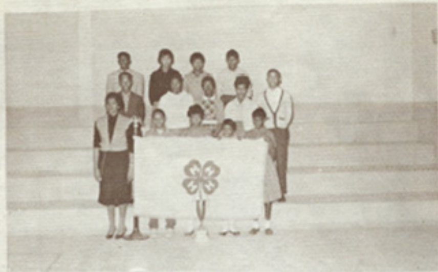
L-H CLUB OFFICERS