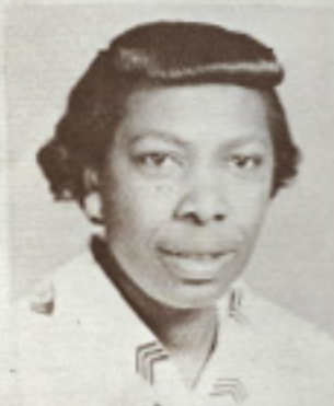
The Sponsors of the Fifth grade Class.