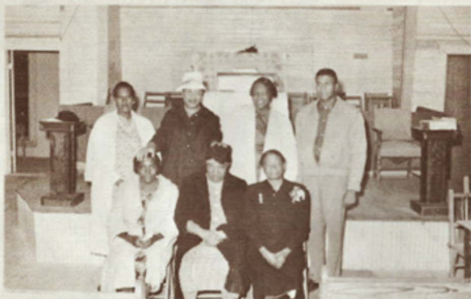
Adult Farmer Class of Morning Star B. C.