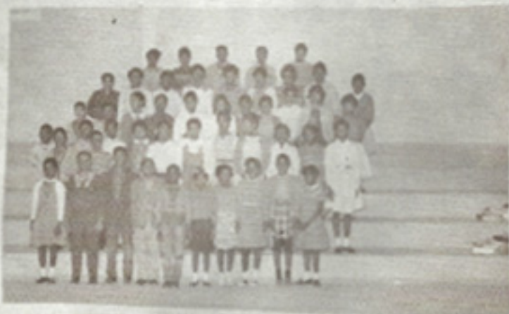
HONOR STUDENTS OF ELEMENTARY DEPARTMENT of SECOND WARD HIGH SCHOOL.