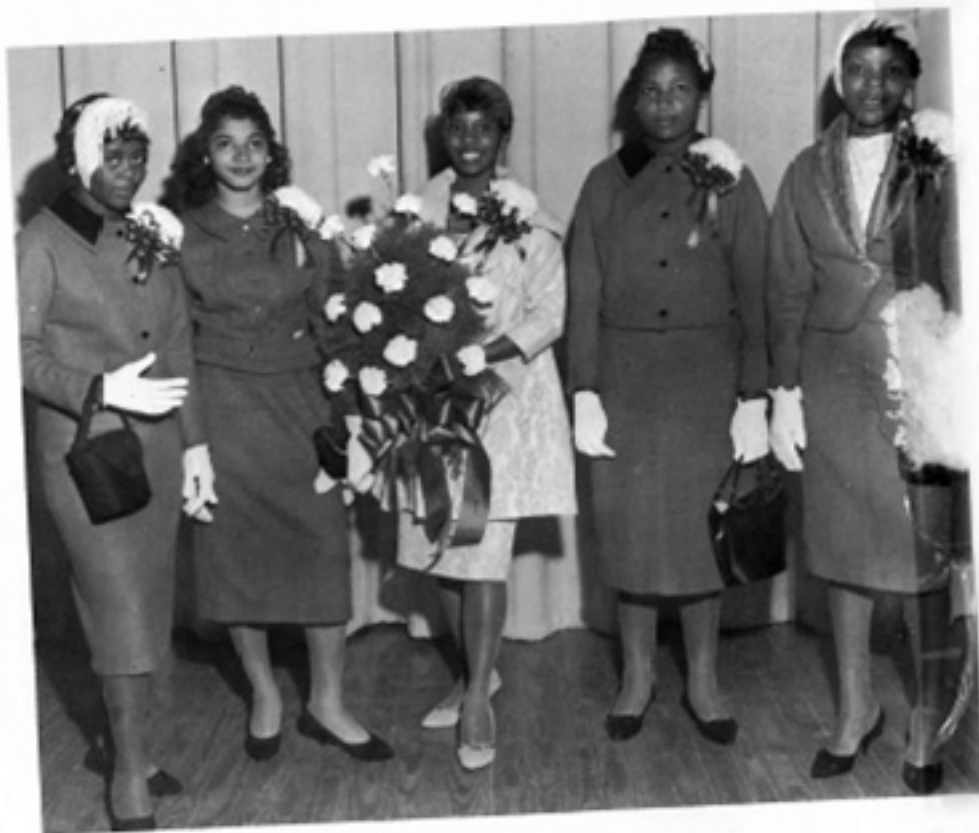
MISS I.H.S. & COURT 1959