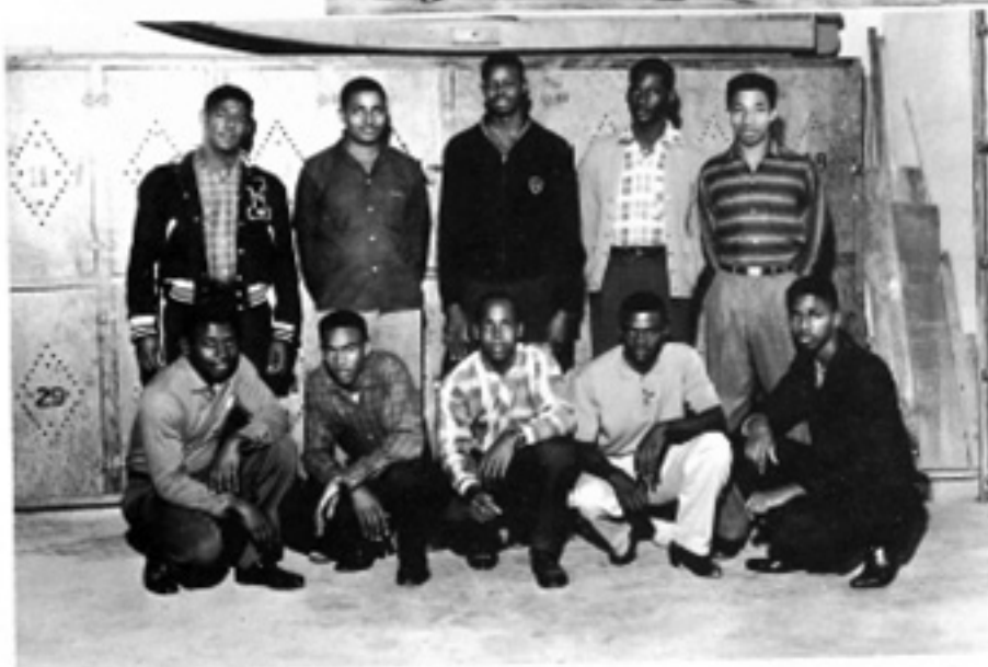
Industrial Arts Club