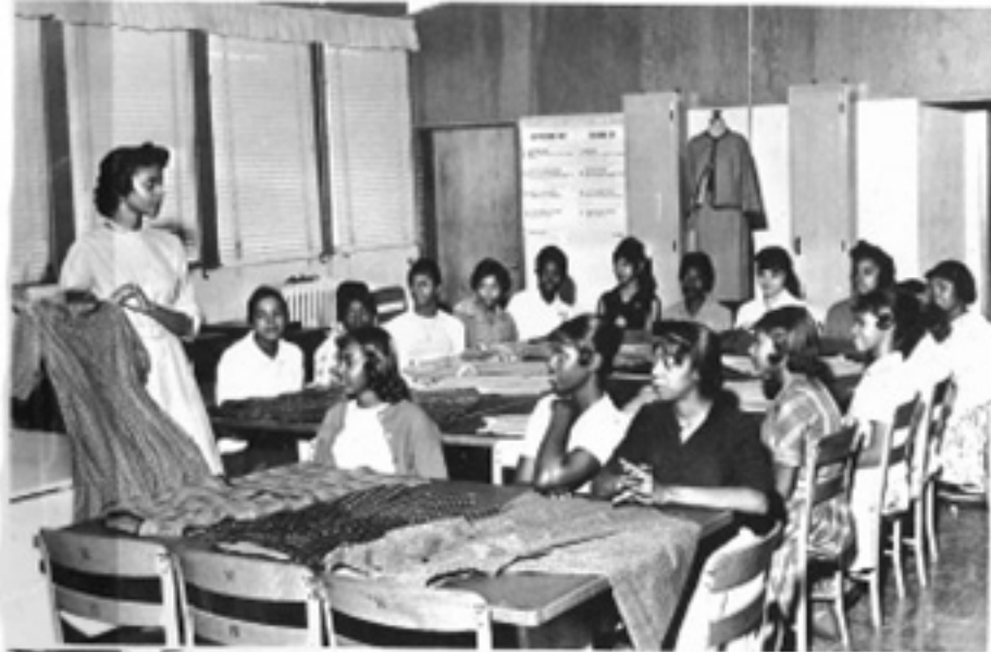
Home Economics Sewing Class