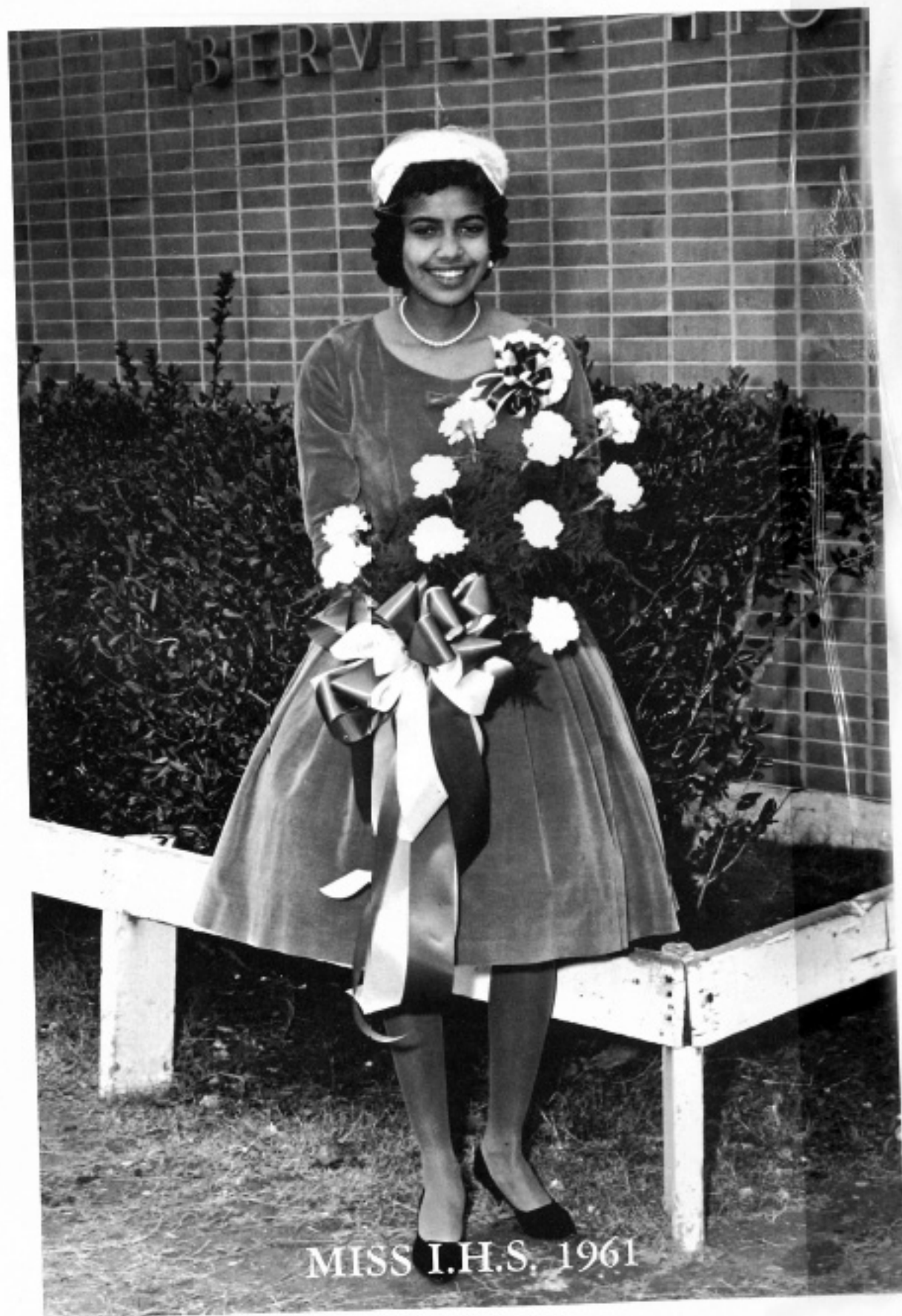
MISS I.H.S. 1961