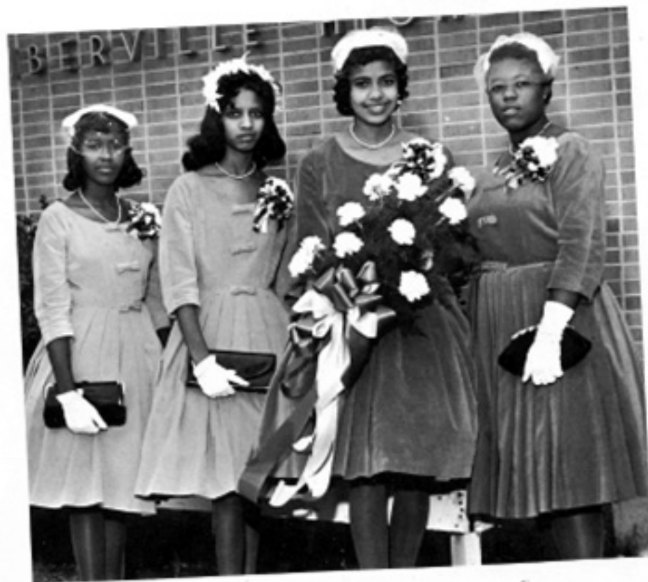
MISS I.H.S. & COURT 1961