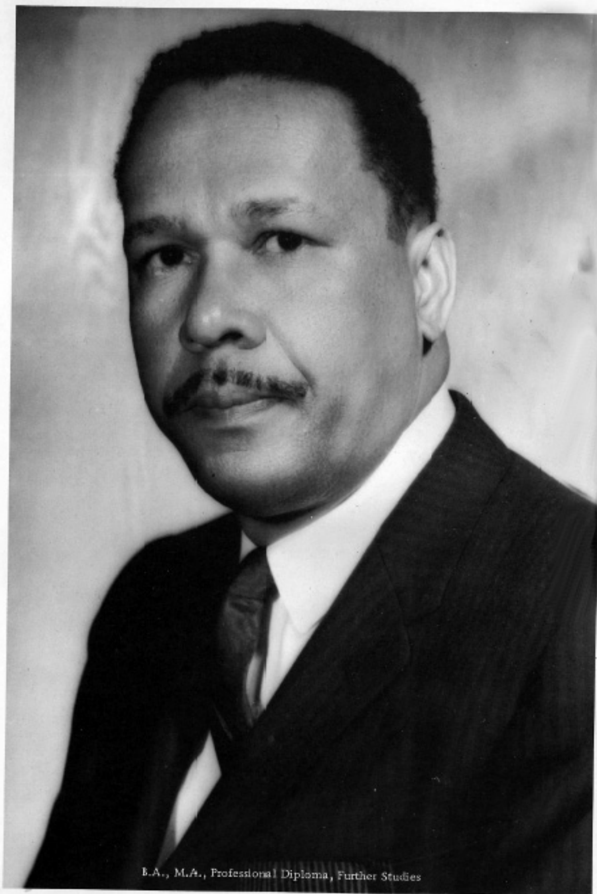
B.A., M.A., Professional Diploma, Further Studies