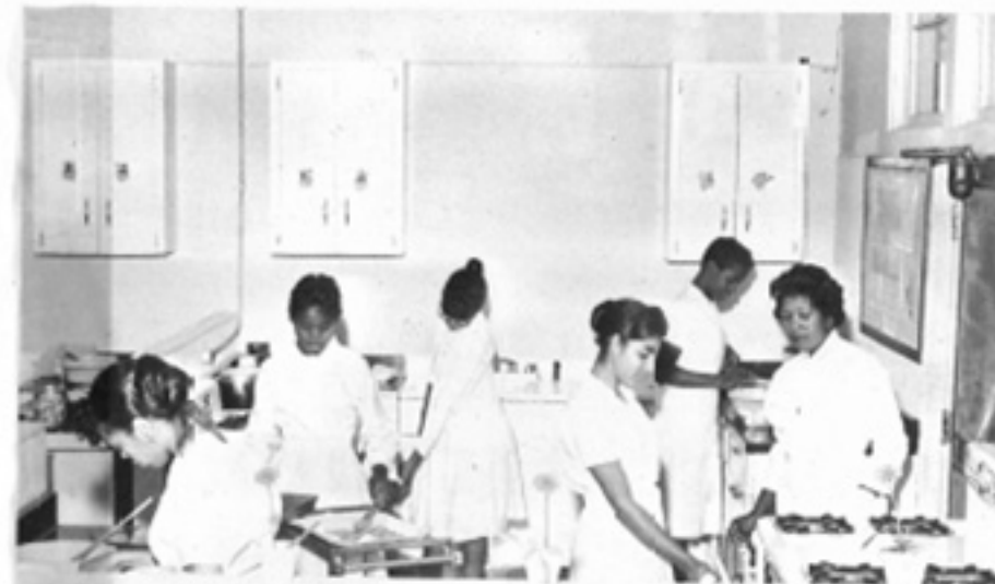
Home Economics Cooking Class