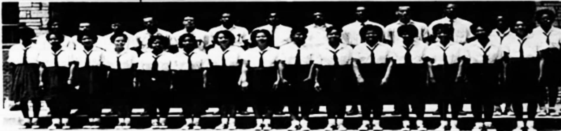
HOLY GHOST HIGH SCHOOL will graduate 32 seniors at commencement exercises at 3:30 p.m. Sunday, May 26, at Holy Ghost