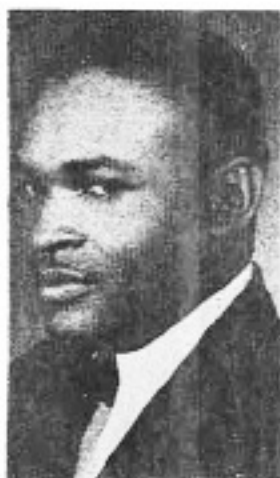
C. O. WILSON General Shop