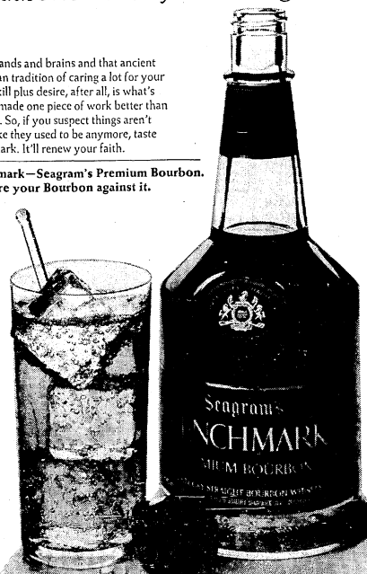
Scagram Benchmark Kentucky Straight Bourbon Whiskey, 86 Proof, Joseph E. Scagram & Sons, Louisville, Ky.

Benchmark—Scagram's Premium Bourbon. Measure your Bourbon against it.