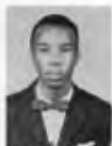
JOHNNY SALTER Photography Editor