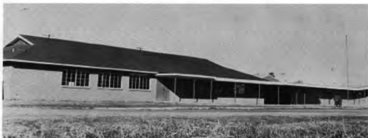
Side View — Classrooms and Gym.