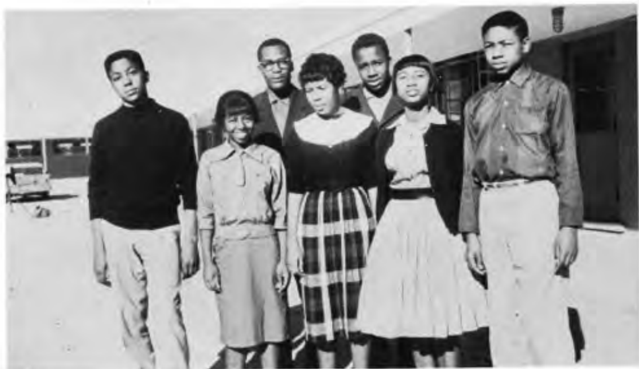
Negro History Club