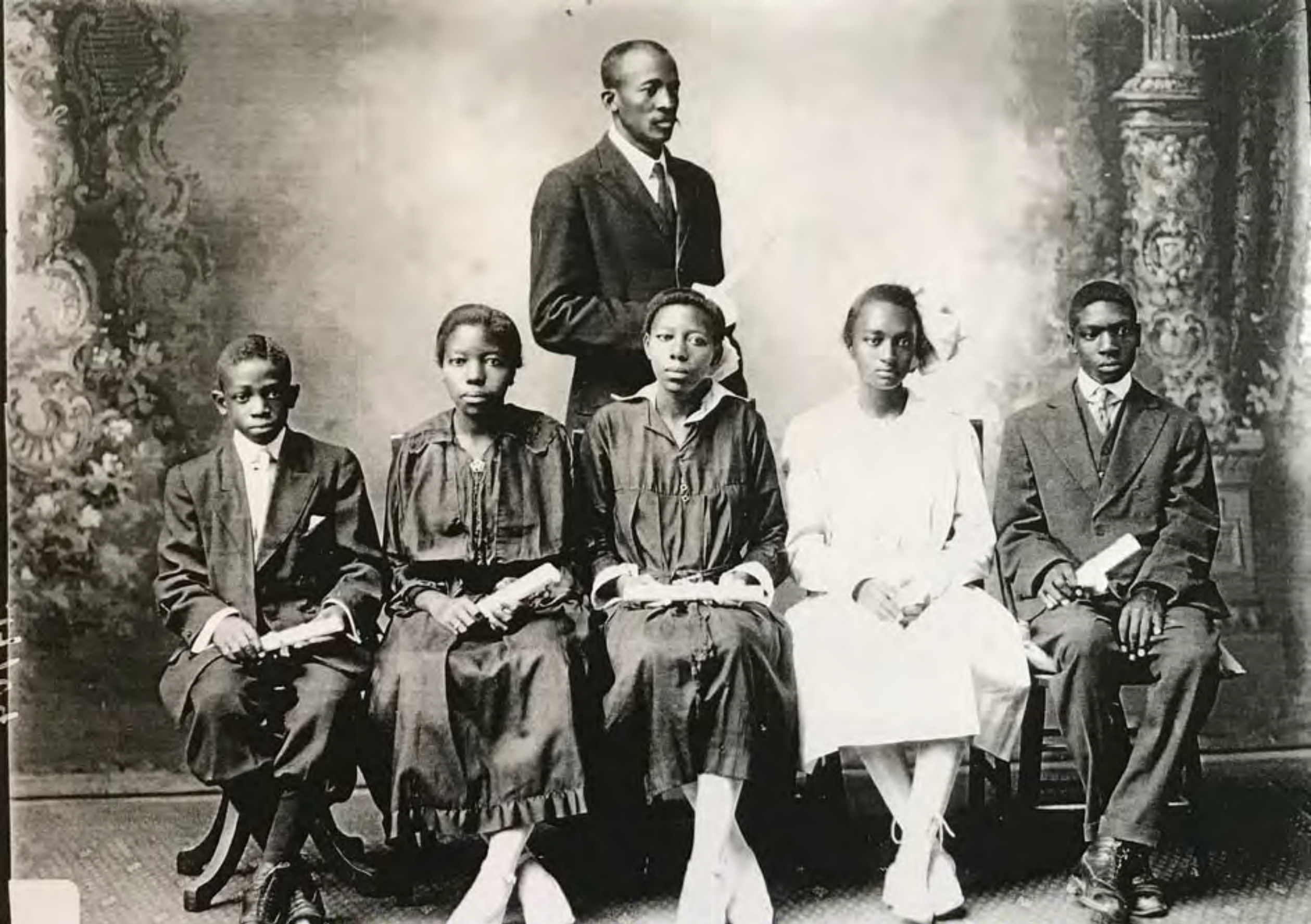
7th Grade Graduates Class of 1917