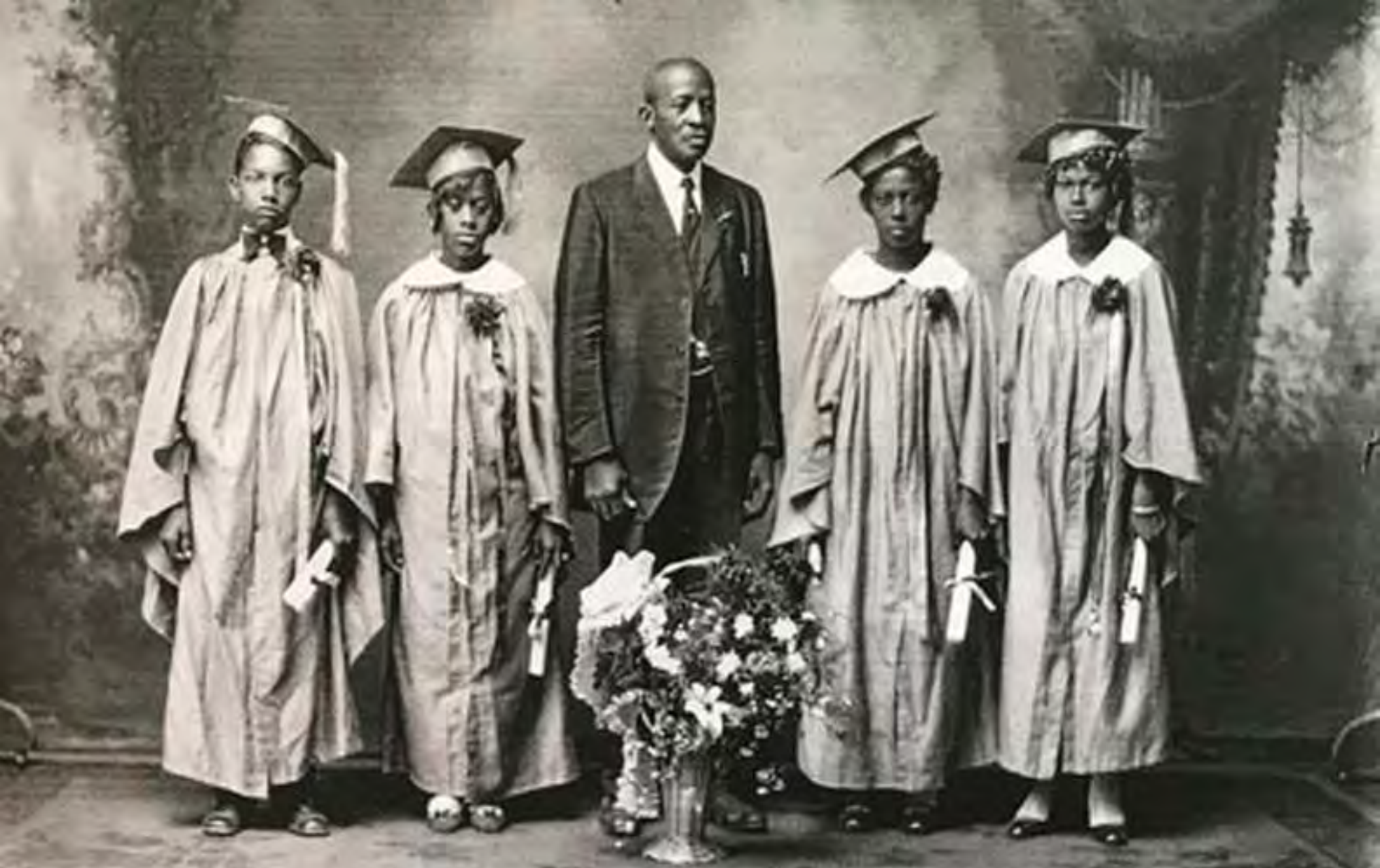
Graduation Class of 1930