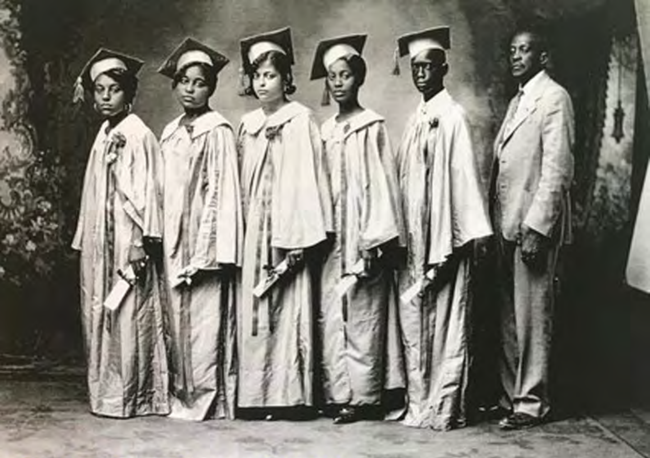
Graduation Class of 1931