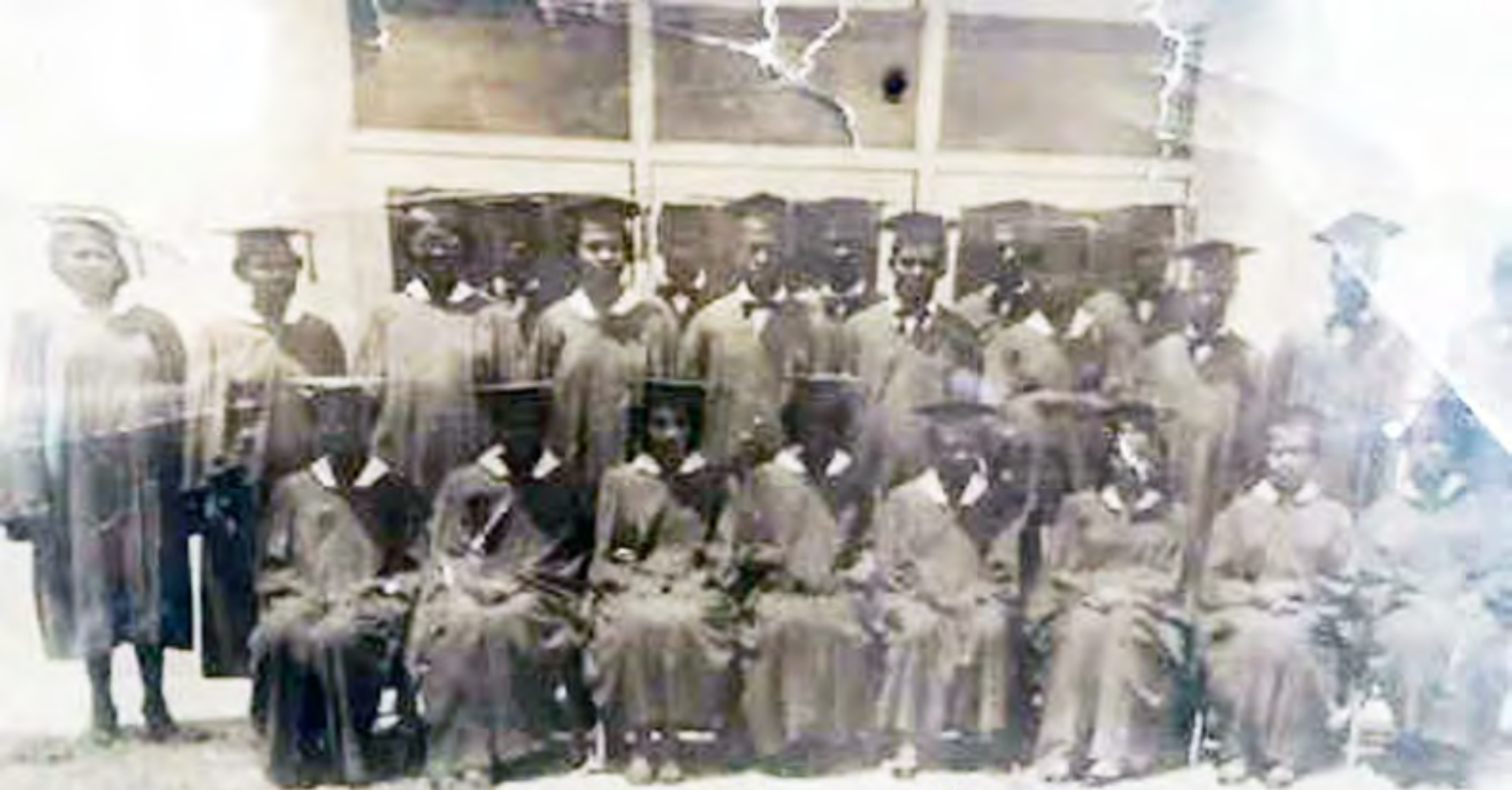
Graduation Class of 1954